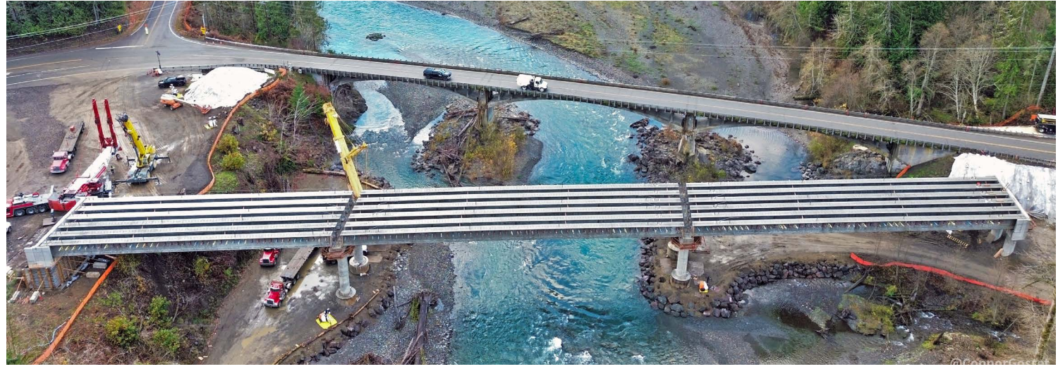
A new US 101 bridge is being built across the Elwha River in Clallam County, replacing the existing bridge that is 98 years old. The new bridge will open to travelers summer 2024.

In 2024, we will continue vital work on preservation, public safety, and fish habitat projects across the Olympic Peninsula. Construction projects will affect the flow of traffic on US 101, 12 and State Routes 8, 116, 109, 108, 104, and 19.